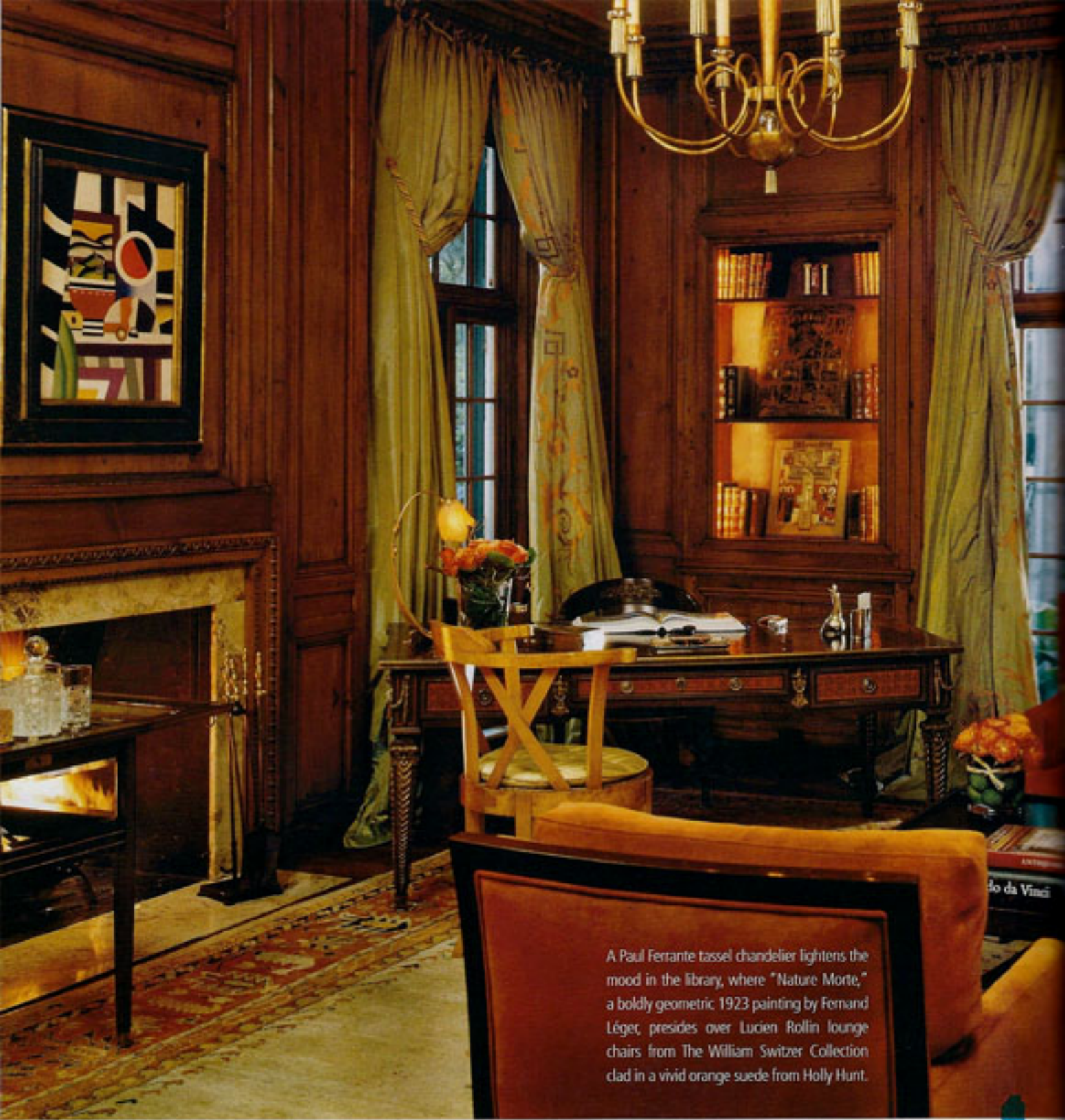
A Paul Ferrante tassel chandelier lightens the mood in the library, where "Nature Morte," a boldly geometric 1923 painting by Fernand Léger, presides over Lucien Rollin lounge chairs from The William Switzer Collection clad in a vivid orange suede from Holly Hunt.