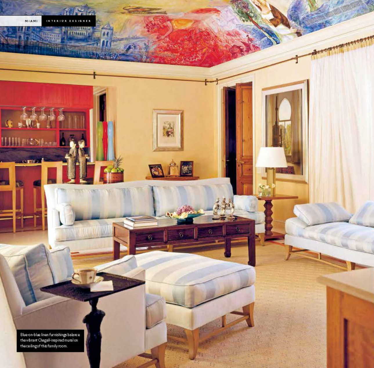
Blue-on-blue linen furnishings balance the vibrant Chagall-inspired mural on the ceiling of this family room.