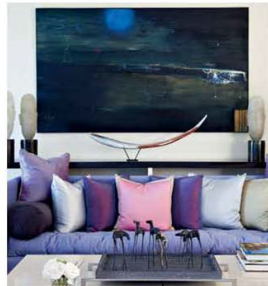
A painting by Christine Pichette hangs behind a periwinkle sofa with contrasting vibrant throw pillows.